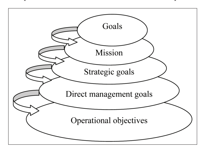
Figure 1. The hierarchy of corporate objectives and management levels in an ordinary view

Strategy is to plan and reach the long-term goals of the organization. Nokia is going toward mobile information techniques from mobile phones, Disney from cartoons to the entertainment industry (Johnson et al., 2011). For both companies to reach their goals they need their own strategies. By another concept, strategy is a behaviour of a series of decisions (Mintzberg, 2007). Strategy is to define the long-term goals, adapt the appropriate methods to do this and ensure the necessary resources (Chandler, 1963). J. Vörös (2010) claims that strategy is to use core competencies in order to create sustainable competitive advantage.