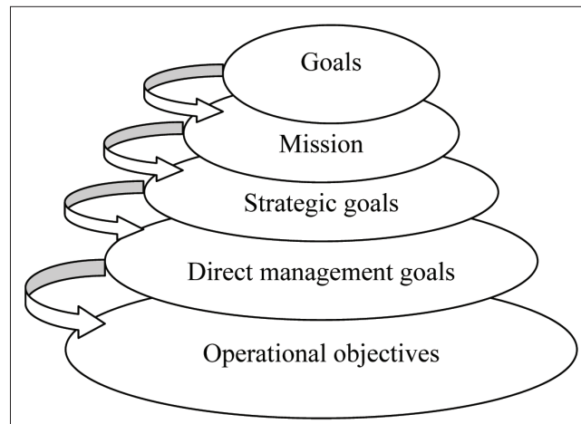
Figure 1. The hierarchy of corporate objectives and management levels in an ordinary view

Strategy is to plan and reach the long-term goals of the organization. Nokia is going toward mobile information techniques from mobile phones, Disney from cartoons to the entertainment industry (Johnson et al., 2011). For both companies to reach their goals they need their own strategies. By another concept, strategy is a behaviour of a series of decisions (Mintzberg, 2007). Strategy is to define the long-term goals, adapt the appropriate methods to do this and ensure the necessary resources (Chandler, 1963). J. Vörös (2010) claims that strategy is to use core competencies in order to create sustainable competitive advantage.